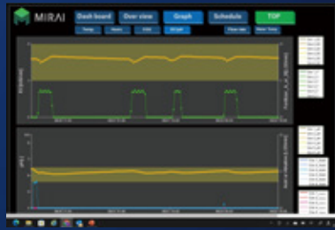
Trend Graph: EC/pH of nutrient solution and fertilizer/pH adjuster input