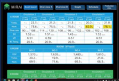
Dashboard: Grasp the current values of various sensors throughout the factory