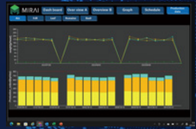
Production & Conditions: Linked display of environmental conditions and production