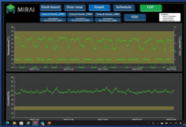
Trend Graph: Relationship between temperature and LED lighting